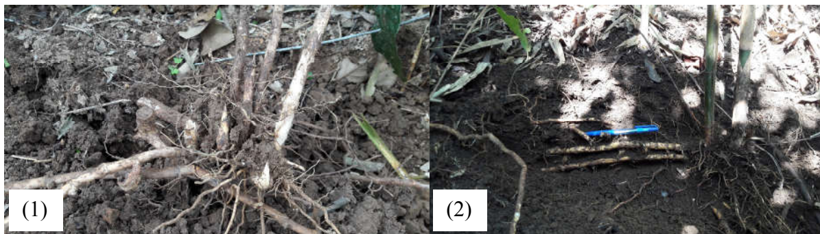
Fig. 1, 2. May cha rhizome in Keo village, Pa Khoang commune (Photo by Truong, December 2016 and January 2017)

Through interviewing people in Usui factory and observing in the field, the bamboo that were collected by the factory May cha has Latin name Pseudosasa amabilis . Other name is Pseudosasa amabilis (McClure) Keng f.ex S.L.Chen & et al. It belongs to Pseudosasa genus, Arundinarieae tribus, Bambusoideae subfamilia, Poaceae familia, Poales order. It is a mixpodial type that has axillary buds on the stem base of the mother bamboo which develop into rhizome and extends horizontally underground. The axillary buds on the rhizome nodes develop into new scattered stems. Meanwhile axillary buds on these new stem base develop into shoot and form a dense bamboo brush. It incorporates the features of both monopodial and sympodial types.