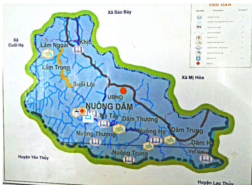
Figure 1. Map of Nuong Dam commune, Kim Boi district, Hoa Binh province

Nuong Dam is a commune with extremely difficult socio-economic conditions in Kim Boi district, Hoa Binh province. Nuong Dam commune lies in the tropical monsoon climate, with two distinct seasons: rainy and dry season, average temperature: 23 0 C, average humidity: 60%, the average rainfall: 1,800 mm. Land of Nuong Dam commune is typically with high fertility suitable for many crops. With hundreds of thousands of hectares of land including the adjoining plots, land in Nuong Dam commune can be used for various purposes, especially afforestation, industrial crops for the agro-forestry and industrial development. The Nuong Dam commune covers an area of 35.66 km 2 (in 2016), with a population of 3,381 people in 1999; 4,058 people in 2016, and a population density of 114 persons/km 2 .